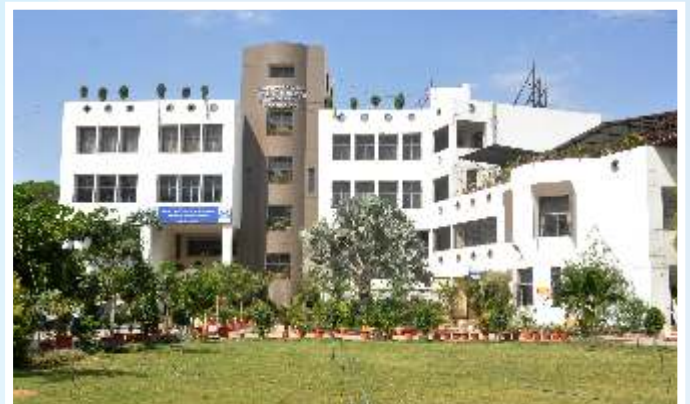
Abhijit Kadam Institute of Management and Social Science, Solapur