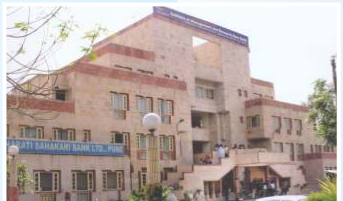
Institute of Management and Research, New Delhi