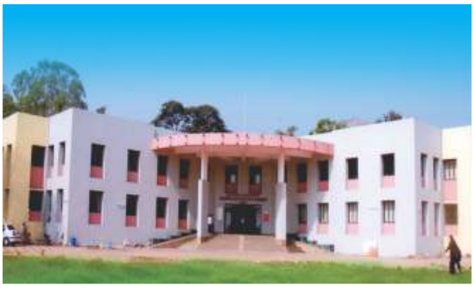
Yashwantrao Mohite Institute of Management, Karad